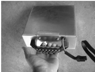
A. Grab the battery by the handle.