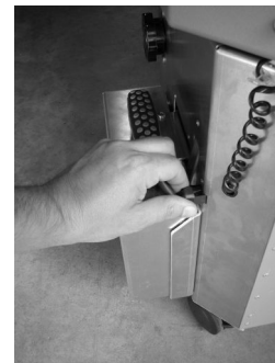
F. Plug in the battery with the black connector.