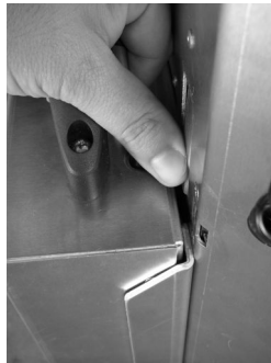
E. While pushing the battery lock button...