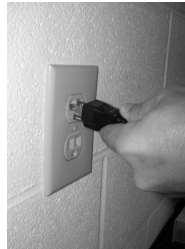
E. Plug the power cord into a wall outlet.