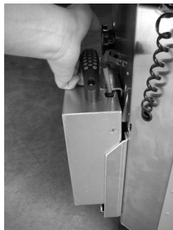
D. Slide the battery downward to lock it in.