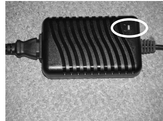
F. The light on the charger will turn orange while charging or green when a battery is finished charging or no battery is connected.