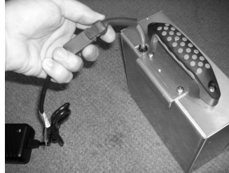
B. Plug the battery-pack into the charger connector.