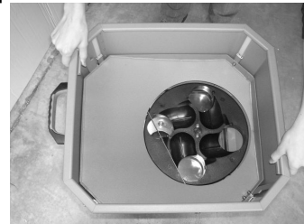
C. Release the hopper release levers.