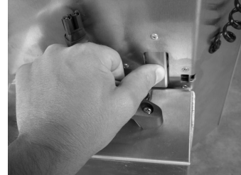
C. Grab the battery pack by the handle.