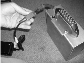
A. Line up the battery connector with the connector from the charger.

When the ball machine is not in use, the battery-pack should always be plugged into the charger and charged. The charger is designed to maintain the proper health of the battery by only charging it as needed and never overcharging. If a battery is left sitting without the charger connected for an extended period of time, the overall battery-life will start to diminish.