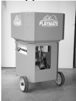
Hopper Shown Raised