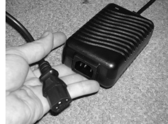
C. Locate the power cord connection on the charger.