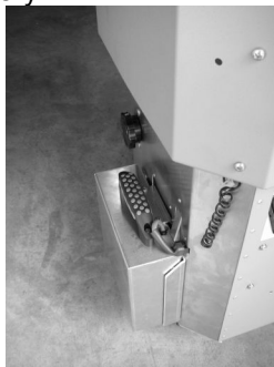
E. When the battery goes all the way in, it should "click".