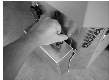
F. Pull the battery-pack up and out.