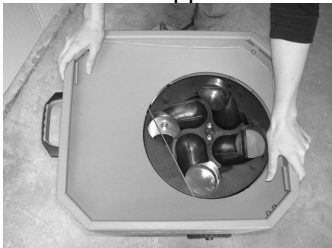
A. Pull up on the hopper release levers.