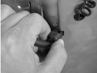
A. Squeeze the black connector.