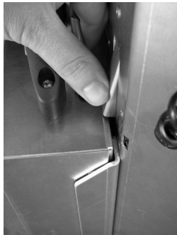
D. Push on the battery lock button.