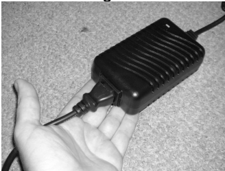
D. Plug the power cord into the charger.