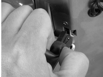
B. While squeezing the black connector, pull the black connector straight out.