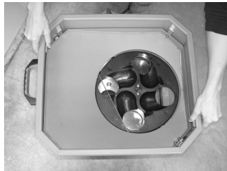
B. Pull the hopper up while depressing the hopper release levers.