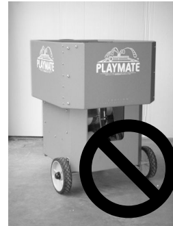
Hopper Shown Lowered